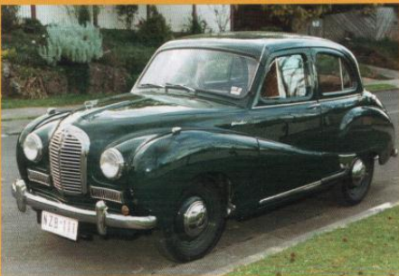
1954 Austin A40 "Best Presented Vehicle Prize"